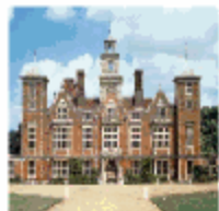
Mansion or Cottage

A rich woman dreamed she went to Heaven, where she saw a mansion being built. "Who is that for?" she asked the guide who was showing her around. "For your gardener." "But he lives in the tiniest cottage around, with barely enough room for his family," she replied. "He might live better if he didn't give away everything he owned to other poor people." Farther on she saw a tiny cottage under construction. "And who is that for?" she asked. "This is for you." "But I have lived in a mansion on earth," she stammered. "I wouldn't know how to live in such a tiny cottage." "You must understand that the Master Builder is doing the best he can with the material you are sending up," her guide replied.